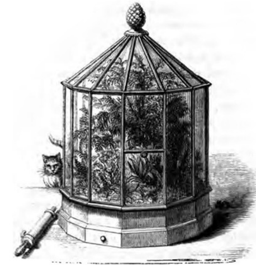
ON THE IMITATION OF THE NATURAL CONDITIONS OF PLANTS IN CLOSELY GLAZED CASES.

'Forecast' shows us a continuity between colonial botany and the contemporary destruction of our planet.